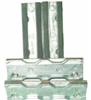
Stone set type ED2

All right reserved. Technical characteristics and dimensions can be modified without notice.